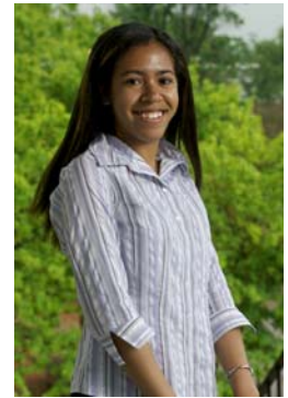
Golda Lake Psychology